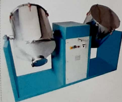
Cony Type Mixer

Simple Type Colour Mixer Conical Type Colour Mixer High Speed Mixer Range From: 25kg, 50kg, 75kg, 100kg etc.