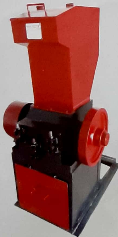
Plastic Article Grinder