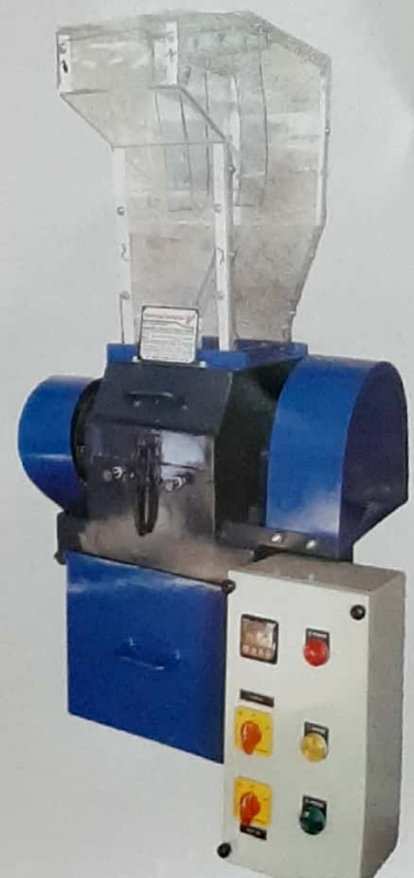
Online Timer Grinder