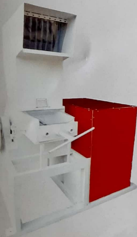
Single Shaft Shredder Manual