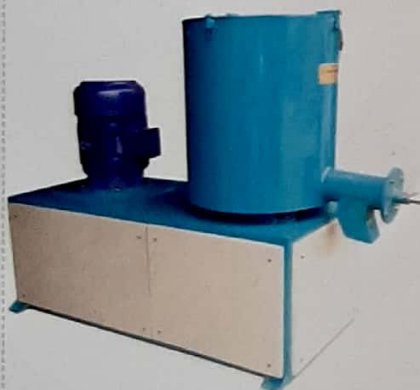
High Speed Mixer