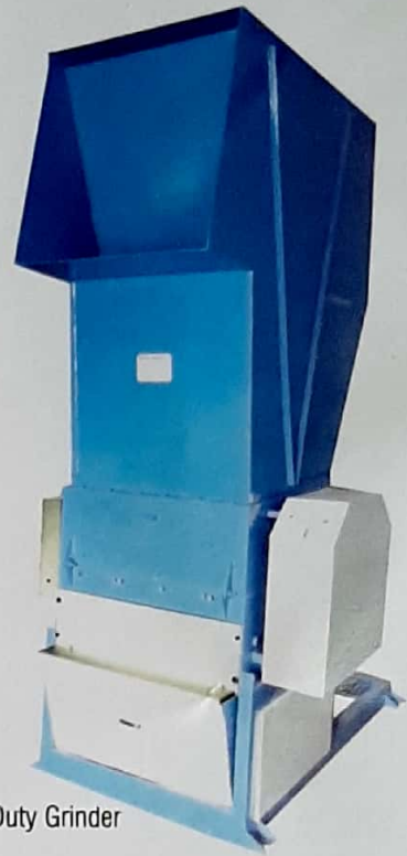
Heavy Duty Grinder